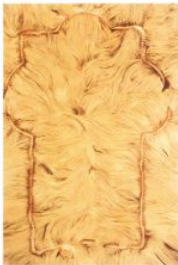
18. ibid. 19. Paul Pfeiffer, Leviathan , 1996. Digital chromogenic print, 26 x 34 in. (66 x 86 cm). December 10, 1996.

Paul Pfeiffer's Leviathan references whiteness differently. In a digital Chromogenic print, the artist delineates the floor plan of a cathedral in a shimmering outline of pink plastic doll flesh sprouting shiny abundant waves of golden hair. As if rising from a sea or carpet of platinum tresses, this architecturally morphed close-up image of the heads of Mattel dolls looks like a wound or a scar branded on the skin. 19 A leviathan is a Biblical beast, a many-headed serpent that represents a mythical monster eventually slain by the sword of Job. Also the title of Thomas Hobbes's philosophical account of the state's rule over the ills of human nature. Leviathan in Pfeiffer's work seems to imply the dynamics of colonial and missionary culture that have ruled over others through ideological and racial domination. Originally exhibited in a solo show called "The Pure Products Go Crazy," Pfeiffer's Leviathan links Christianity to notions of extreme purity, whether moral or racial.