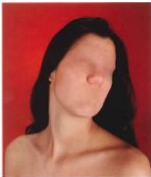
Artz + Gertler, Dims, 1999, Meris, 1994. Digitally altered analog prints, each 98 x 40 in. (25 x 102 cm).